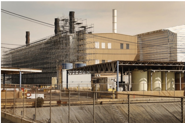
The Exide Technologies battery recycling plant in Vernon, shown in 2020, was forced to close in 2015.

Exide, which acquired the plant in 2000 and has since filed for bankruptcy, did not respond to a request for comment left with its attorney. The company had argued in the past that it was not responsible for lead contamination in the neighborhoods, and blamed other sources such as industrial facilities and lead-based paint.