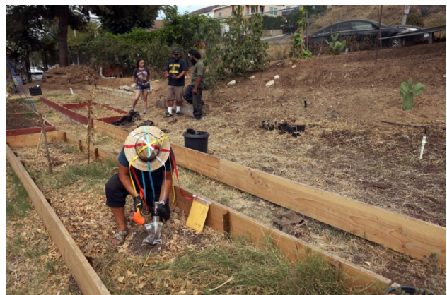
A worker with East Yard Communities for Environmental Justice collects soil samples from a community garden in Boyle