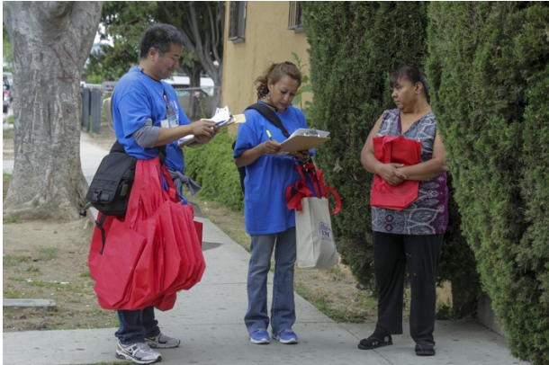
Volunteers conduct a survey of residents who live near the former Exide battery recycling plant in June 2017.

lead. The toxics agency collected more than 8,100 soil samples, and testing revealed 76% contained lead levels higher than the California safety threshold.