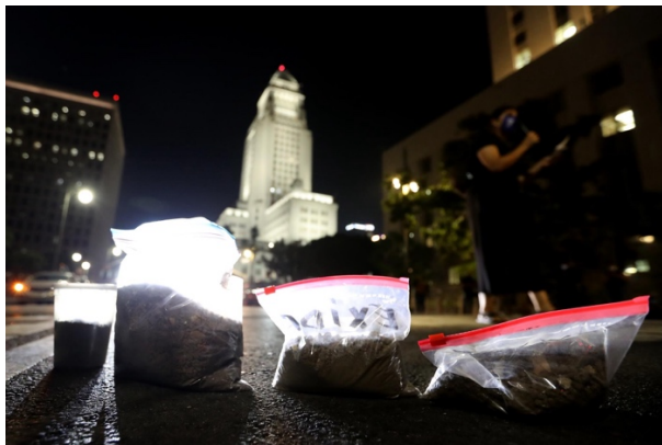
Community groups left bags of soil near Los Angeles City Hall during an Exide protest in October 2020.