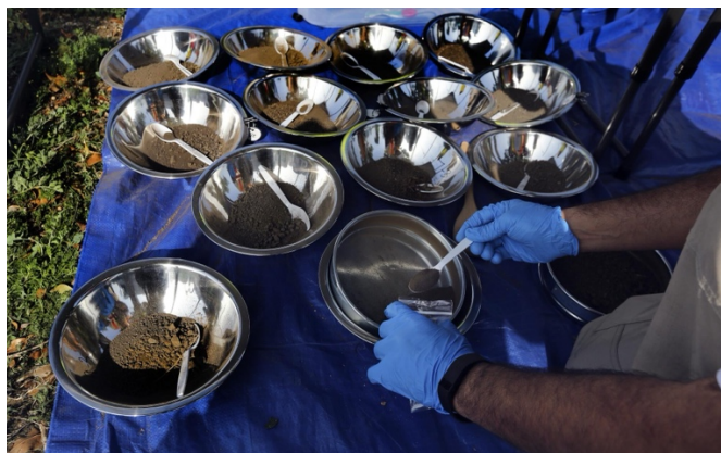
A worker spoons soil collected from the yard of a home near the former Exide battery recycling plant into a jar for lead testing.

The Times spoke with more than a dozen residents and homeowners of failed cleanups who were unaware that their home