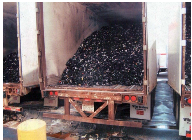
The California Department of Toxic Substances Control photographed these trucks during an inspection of the Exide plant in September 2013. The state wrote that “the doors on the 40ft trailers, that were parked in the staging area and contained hazardous waste plastic chips, were open. Puddles of water could be seen beneath the trailers.”

The state decided to prioritize properties with the highest concentrations of lead, a strategy designed to protect residents at highest risk of exposure.