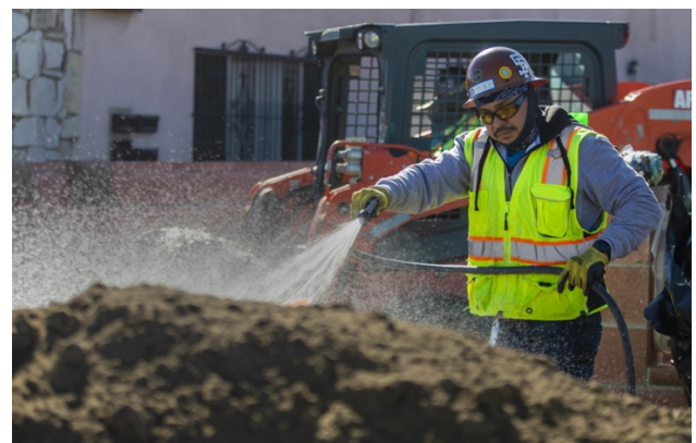
A worker sprays water on a pile of soil during lead remediation work in Maywood in November.