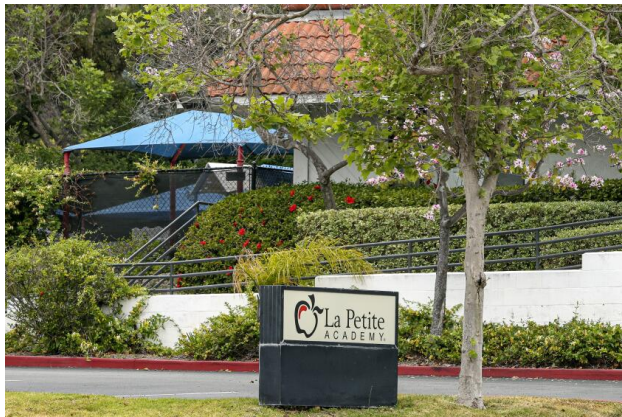
Drinking water at 1 in 4 California child-care

Complying with the new rules is estimated to cost private businesses roughly $230 million a year, including expenses for medical surveillance, air monitoring and personal protective equipment, according to regulators. Industry representatives disputed that estimate, saying costs had been drastically underestimated and that small businesses would be walloped by the added expense.